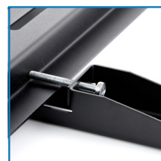
Screen protection against falling using screws