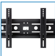
The support plate features numerous holes for installation on concrete and wooden surfaces