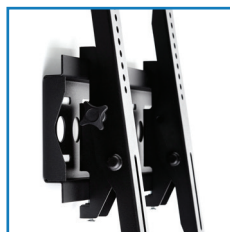
Possibility of tilting the screen from -12^{\circ} to +6^{\circ}