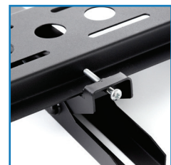
security screws prevent from accidental fall or unauthorised removal of a screen