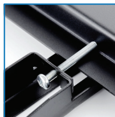
Screen protection against falling