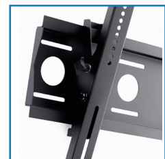
Screen tilt adjustment