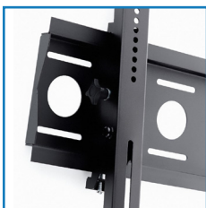
Robust design to ensure load capacity up to 80 kg