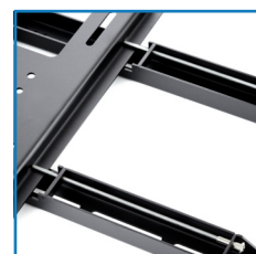
Security screws provide protection against accidental fall or unauthorised removal of a screen