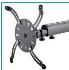
4 mounting holes