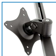
360° VESA head rotation