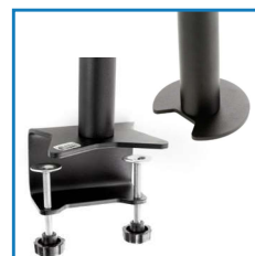
2 types of desk fastenings (clamp mount and desk through mount)